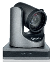
USB VC Camera PTZ